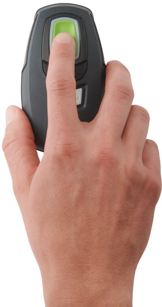
Inspire Sleep Remote

Inspire works inside your body while you sleep. It's a small device placed during a same-day, outpatient procedure. When you're ready for bed, simply click the remote to turn Inspire on. While you sleep, Inspire opens your airway, allowing you to breathe normally and sleep peacefully.