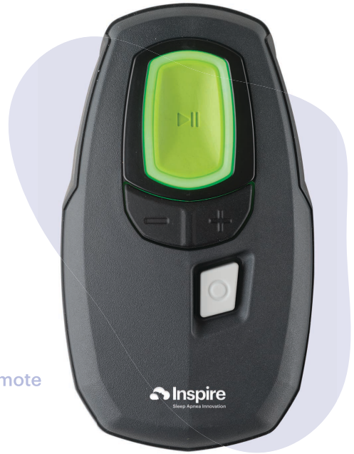
Inspire Sleep Remote

Inspire works inside your body while you sleep. It's a small device placed during a same-day, outpatient procedure. When you're ready for bed, simply click the remote to turn Inspire on. While you sleep, Inspire opens your airway, allowing you to breathe normally and sleep peacefully.